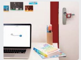
Design & Technology